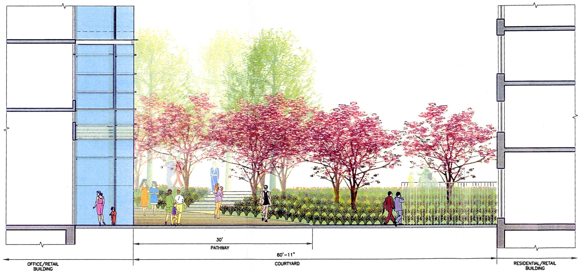
SECTION E-E@ 23RD ST. PEDESTRIAN ACCESS