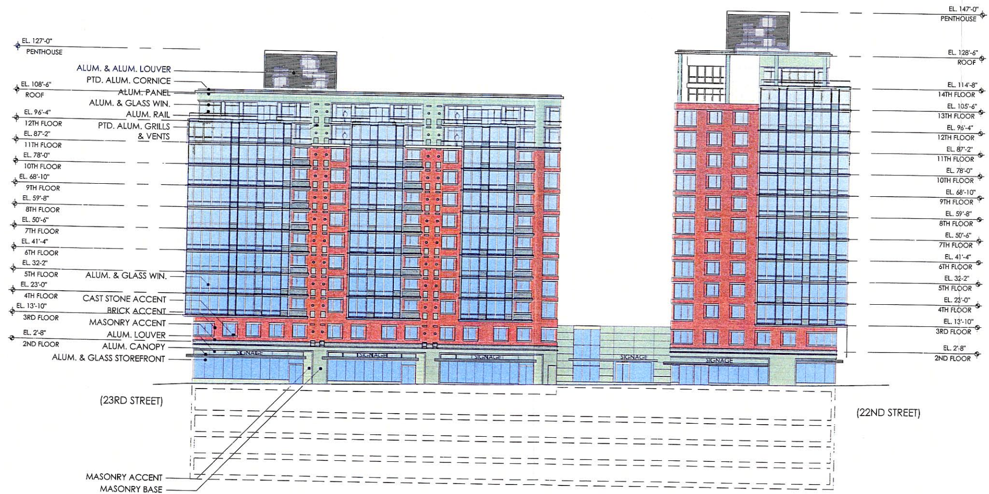
A3.03 SOUTH ELEVATION (I STREET)