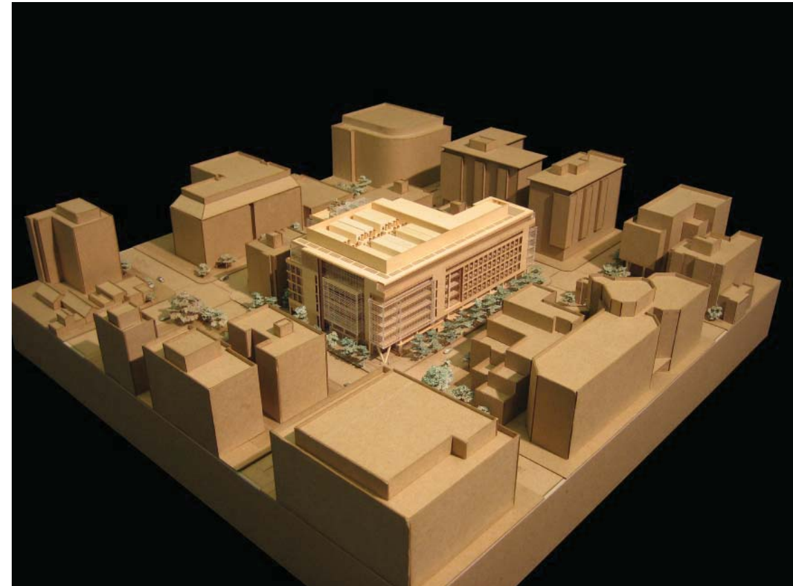
MODEL PHOTOGRAPH - AERIAL VIEW OF SOUTHEAST CORNER