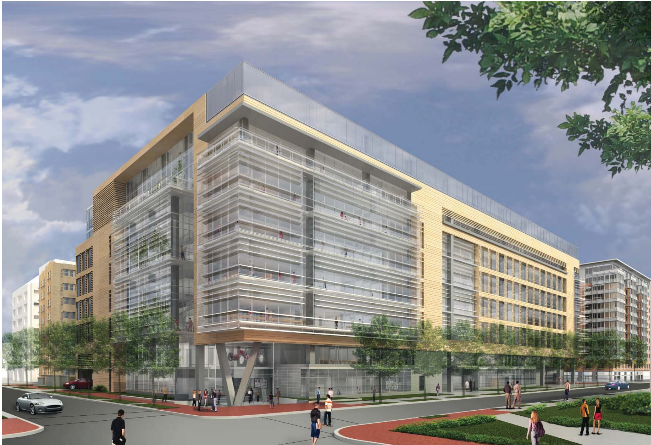
PERSPECTIVE VIEW CORNER OF 22nd and H STREET