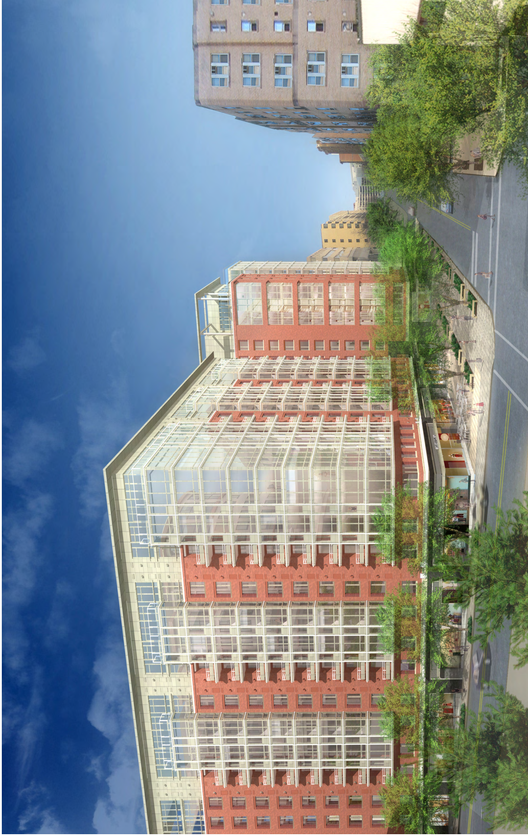
VIEW FROM 23RD STREET AND EYE STREET - PREFERRED DESIGN