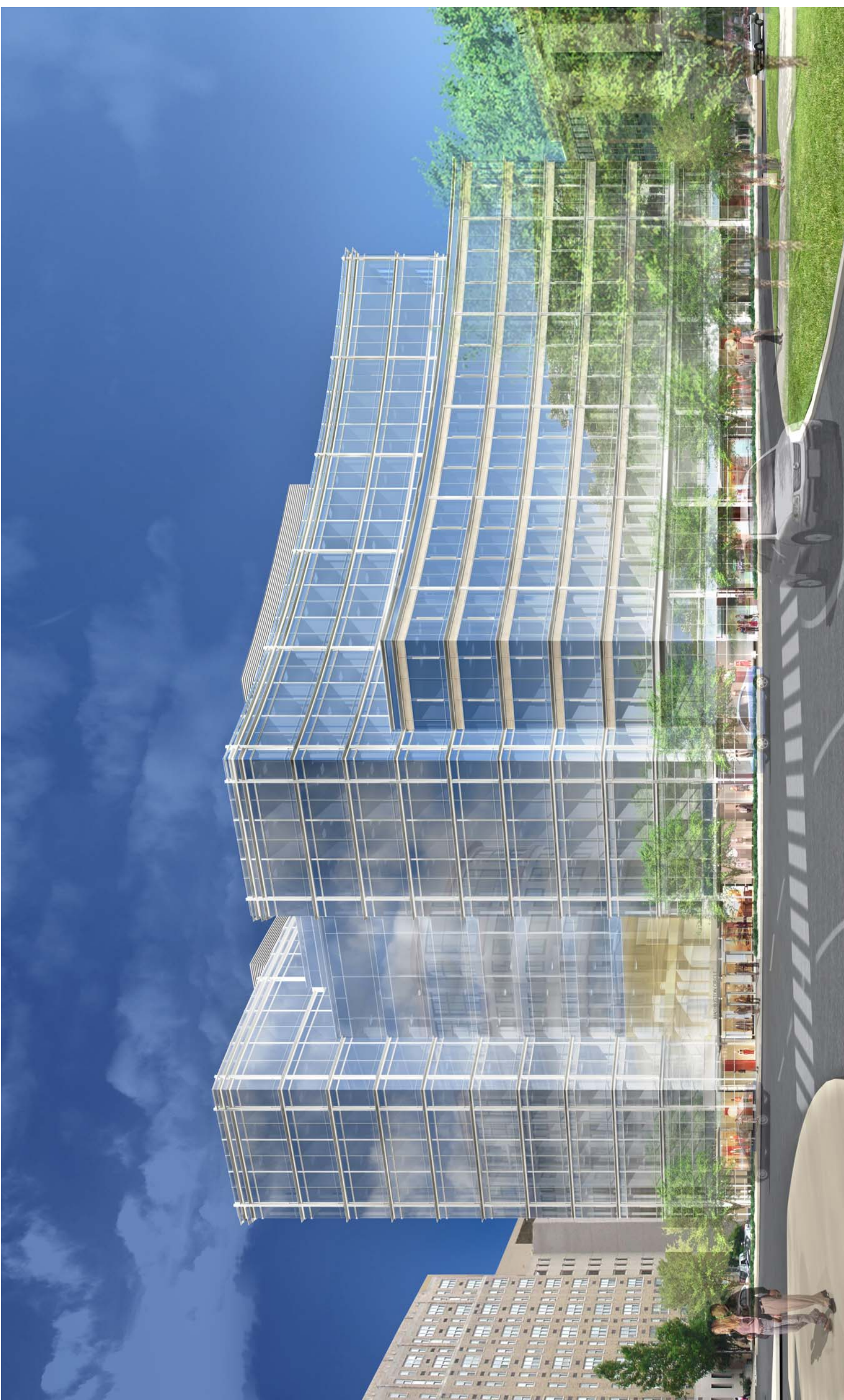
VIEW FROM WASHINGTON CIRCLE