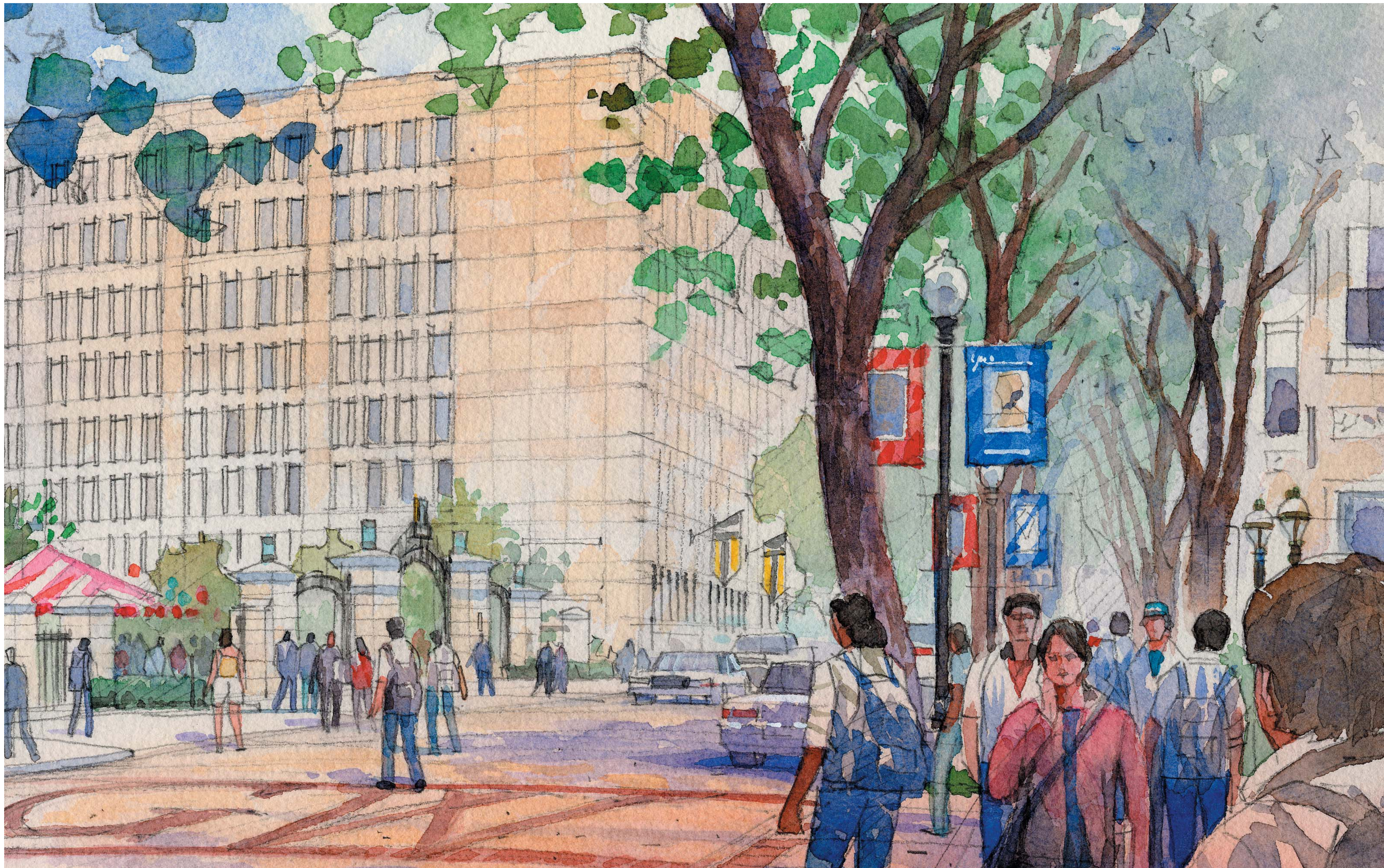
H Street looking west between 21st and 22nd Streets