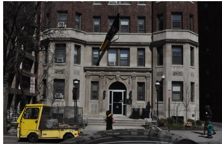
4.) View of Schenley Hall entry looking north from across H Street.