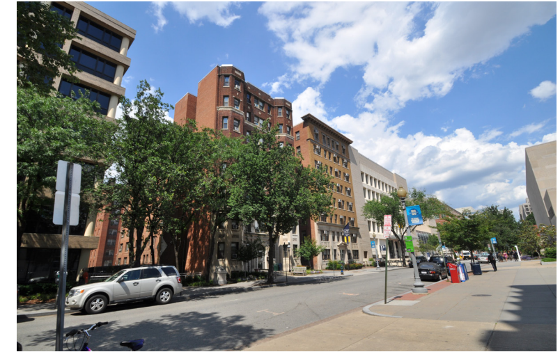
3.) H Street, looking Northeast, across from Schenley and Crawford Halls with Marvin Center in the distance.