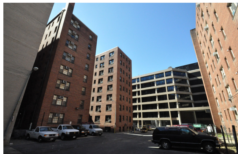
7.) View from Marvin Center loading area, looking southwest towards Academic Center. Left to right: Crawford Hall, Schenley Hall, The West End.