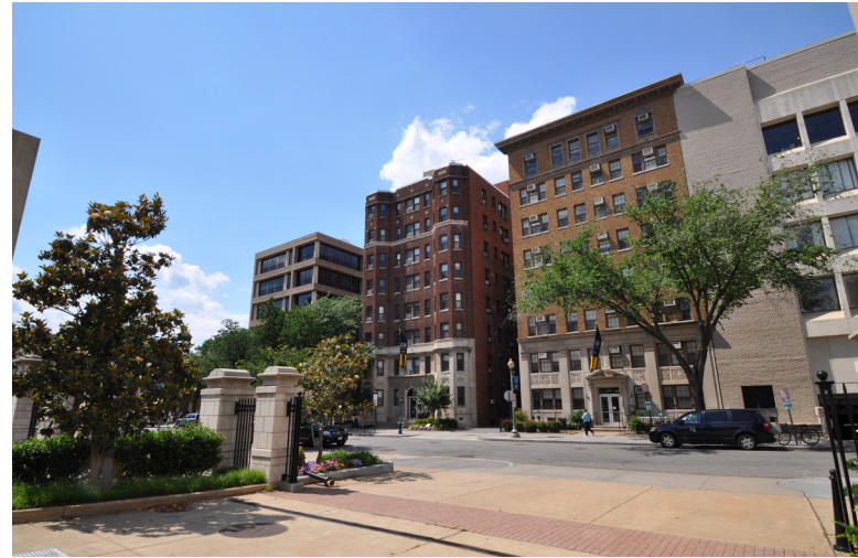
1.) View across H Street, from Kogan Plaza, looking north at Schenley and Crawford Halls.