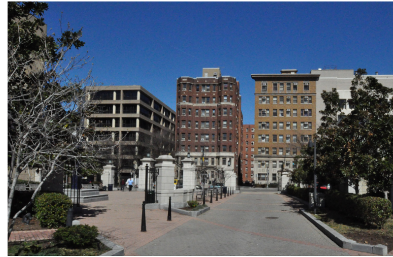
2.) View from Kogan Plaza, looking north at Schenley and Crawford Halls.