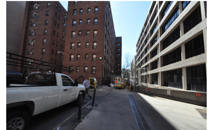
6.) View along service alley between The West End and Academic Center, looking south towards the rear of Schenley Hall.