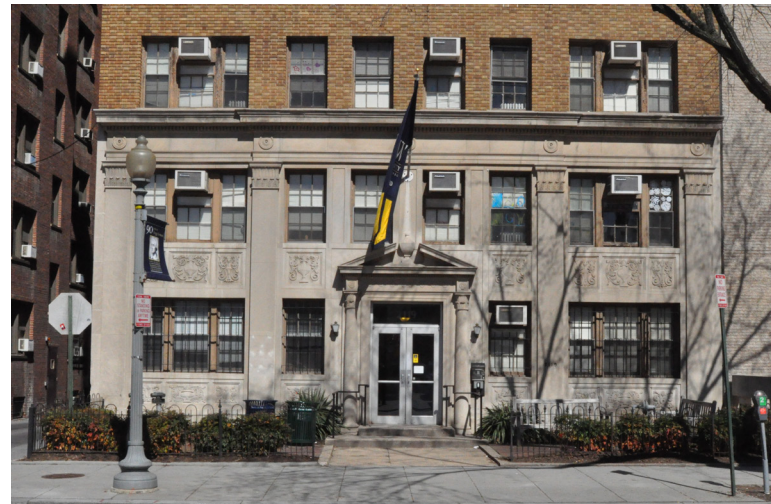
5.) View of Crawford Hall entry looking north from across H Street.