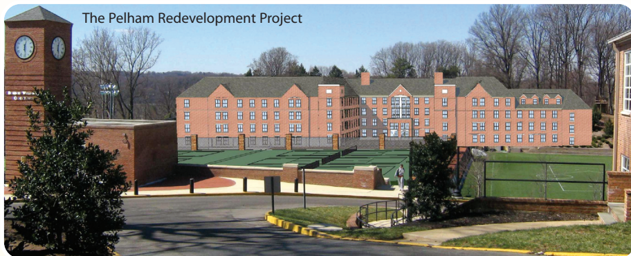
The Pelham Redevelopment Project