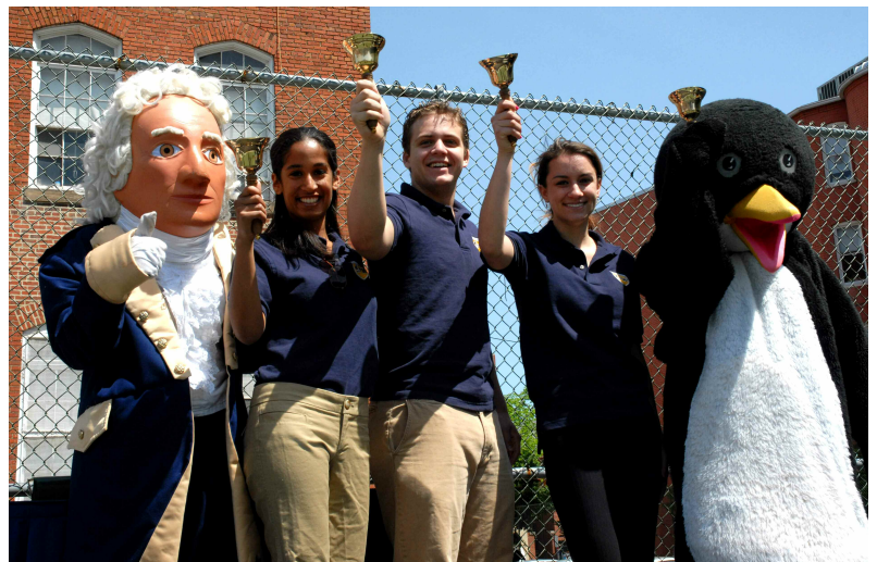
GW students are joined by GW and SWW mascots as they celebrate the public-private development partnership

The University’s commitment to the School Without Walls is further exemplified by the GW’s Trachtenberg Scholarship Program which provides full, four-year scholarships to academically talented seniors. The scholarships include tuition, fees, housing, meals and books and is valued at approximately $200,000 over four years. This program has benefited 93 students since its inception in 1989 – 12 of whom have been SWW students.