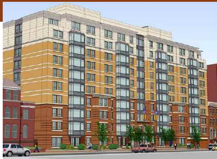
Concept rendering for new GW residence hall at 2135 F Street, N.W.