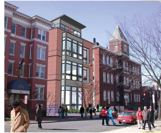
Proposed addition shown to the left of existing SWW

The unique relationship between SWW and GW began in 1980 . Since that time, the two institutions have collaborated on several levels with the goal of fostering a mutually beneficial learning environment . Examples of these joint initiatives include: