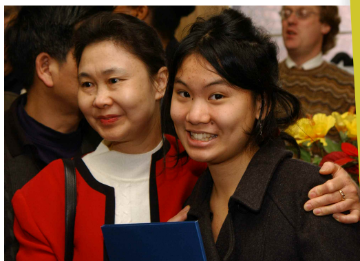
SWW student learns she will be a Trachtenberg scholar.

This approval set in motion plans for GW to combine the back parking lot with the neighboring GW tennis courts to house a new undergraduate residence hall with approximately 474 beds and 178 underground parking spaces. DCPS will use the approximate $12 million generated from the sale (in addition to $6 million already allocated by DCPS) to modernize the facilities and create additional space for classrooms, as well as a media center and outdoor space. Both the GW and SWW projects commenced in late fall 2007 and are anticipated for completion in 2009. For weekly construction progress updates on GW's new residence hall, visit the campus development section of www.neighborhood.gwu.edu