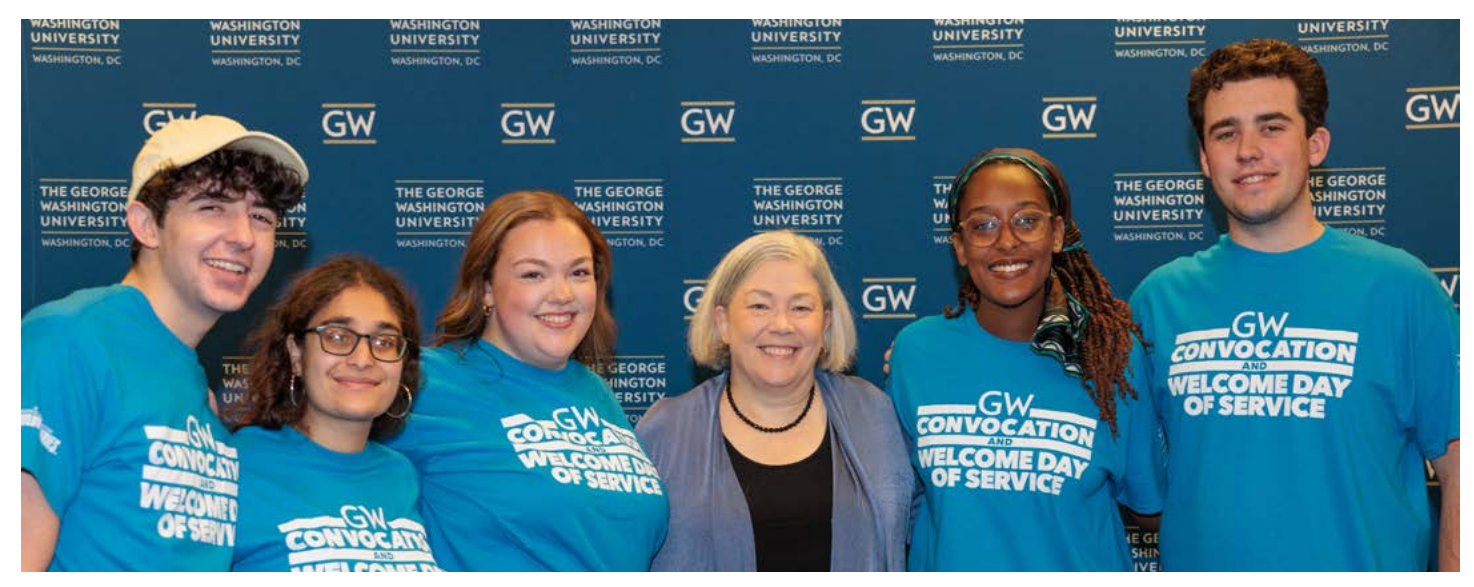
GW students and President Granberg are all smiles at GW's annual Convocation and Welcome Day of Service ceremony.