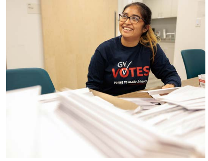
GW Votes, a nonpartisan coalition of students, encourages their peers to show up at the polls.