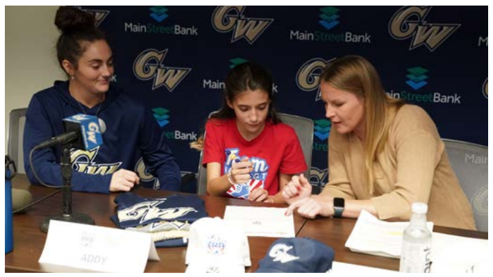
GW Revs give back to the community by spending some quality time with D.C. school students.

At the George Washington University, student-athletes strive to be champions in competition, in the classroom and in the community. Several GW student-athletes have joined together to make a difference by educating at-risk youth in the community about HIV/AIDS awareness and prevention through The Grassroot Project (TGP) and Grassroots. Started more than a decade ago as HIV/ AIDS awareness initiatives in D.C. schools, The Grassroot Project has now built an innovative model that provides low-cost, wrap-around health promotion programs for youth. GW student-athletes joined other college athletes to educate youth and engage their families in health communication skills-building workshops, while helping to connect young students and caregivers to clinical and social service providers. TGP's programs use sportsbased games as a tool to both increase the retention of key health messages and break the ice around sensitive health topics. By combining movement with learning, GW and TGP were able to increase physical activity in schools at the same time as helping students to meet basic health literacy standards.