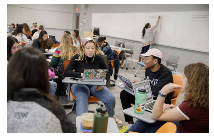
Community-engaged scholarship in action: GW's Human Services and Social Justice (HSSJ) students engage in deep classroom discussion.

Students partnered with the Learning by Giving Foundation to create and operate their own small foundation. Students developed criteria for a fund, circulated the request for proposal to local organizations, evaluated proposals and selected a recipient. This year, the students were proud to grant $7,000 to HIPS, an organization that is working to advance reproductive justice.