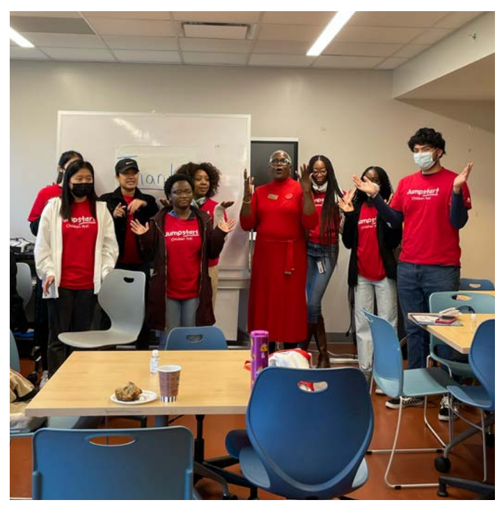
GW Corps members lead preschool students in a song, one of the many ways members spend their time with the children.