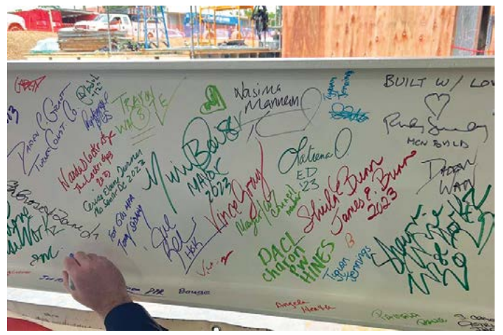
The last beam of Cedar Hill Medical Center adorned with hundreds of commemorative signatures.