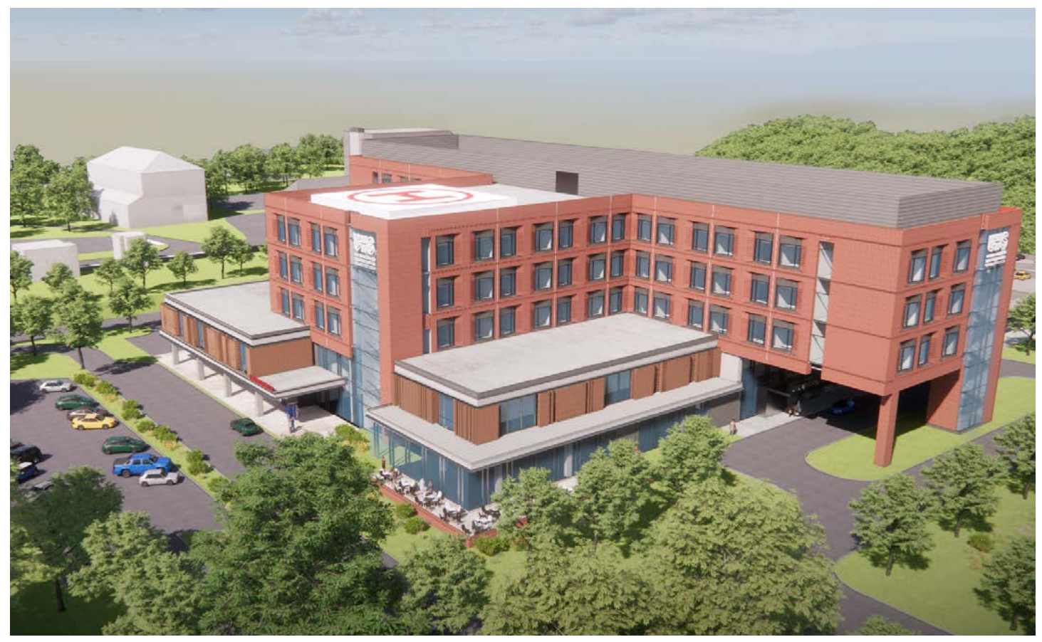
An aerial rendering of the Cedar Hill Regional Medical Center.