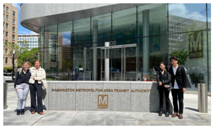
GW EMSE students at WMATA headquarters in Washington, D.C., where they presented their senior design project.