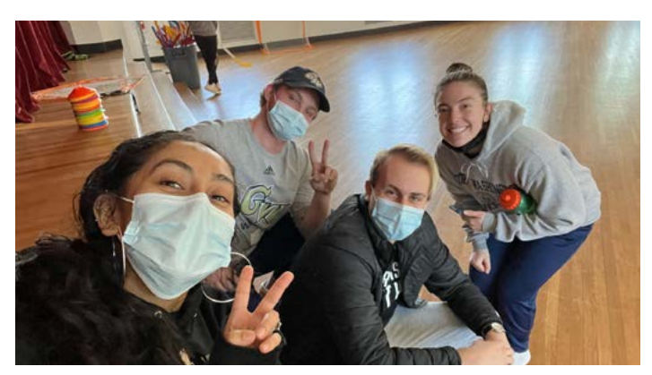
Witness the GW Grassroot Project in action.