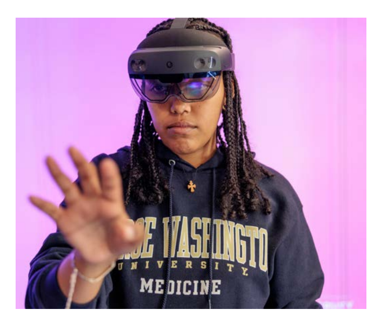
A DC HAPP student uses virtual reality goggles at the SMHS Immersive Learning Center.