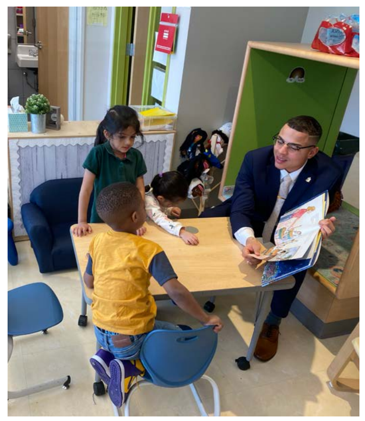
DCPS preschool students gather around for story time.