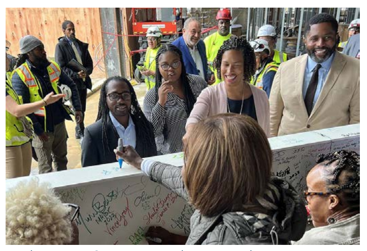
Washington, D.C., Mayor Muriel Bowser and community members sign the final beam of the Cedar Hill Medical Center to commemorate the construction milestone.