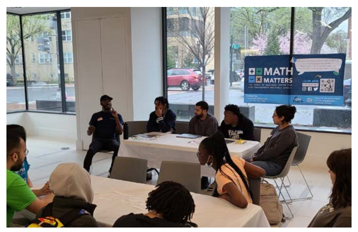
DCPS Math Matters students listen intently during a Math Matters tutoring session.

Tutors receive weekly training through a one-credit GW Teach seminar on how to present the custom curriculum to their students as well as how to work with middle school students. Topics range from entering communities respectfully to the mindset of middle schoolers and goal setting.