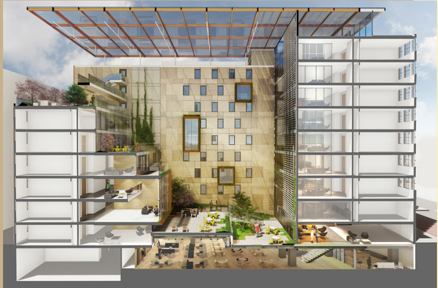
A design concept for the renovated Thurston Hall.

As part of the university's strategic initiative to enhance the student experience, GW is seeking to re-envision and fully renovate Thurston Hall. This 91-year-old building has been a major component of the first-year student's campus residential experience, and the core focus of this renovation is to build a living and learning community that prioritizes new and inviting spaces that support increased engagement, resources, and academic success.