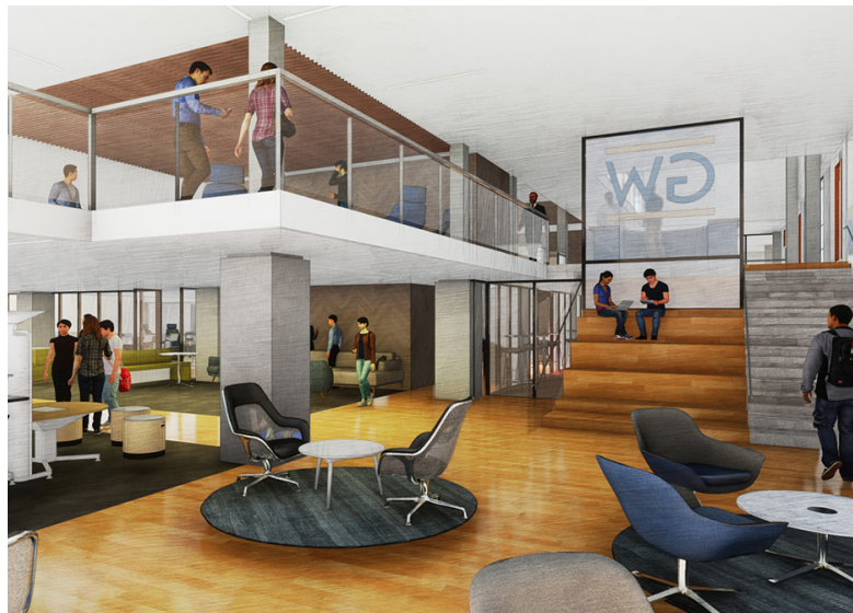
A design concept for the Thurston Hall common area space. (Courtesy VMDO Architects, PC)

1 Pending appropriate regulatory review/approval by the DC Office of Planning and Historic Preservation, DC Department of Transportation, Commission on Fine Arts, and/or DC Zoning Commission.