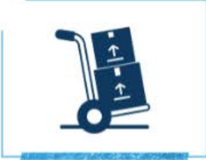
Moving & Relocation